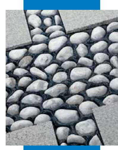
An example of grouted ornamental stones