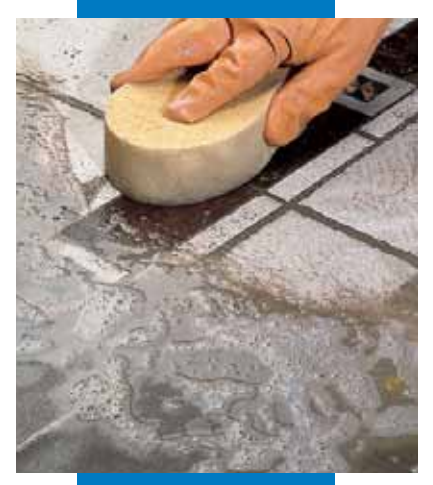
Finishing a ceramic tile floor with wood inlays with a sponge