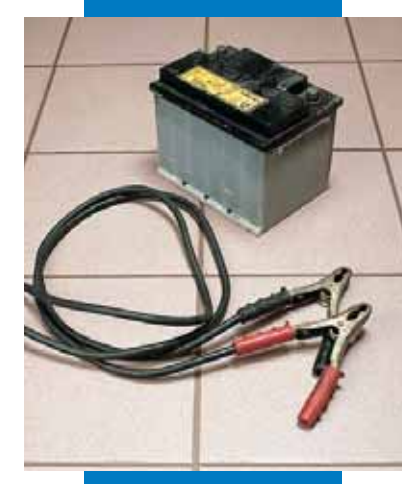
An example of a grouted battery room

Clean tools and containers with plenty of water before Kerapoxy hardens.