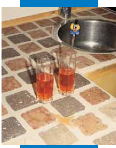
An example of a bonded and grouted kitchen worktop