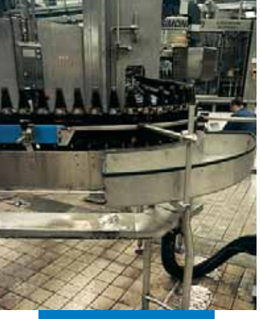
An example of a grouted brewery floor