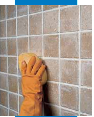
Finishing of single fired tile wall with a sponge