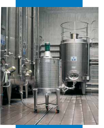
An example of a grouted wine cellar floor

When Kerapoxy has hardened, removal is only possible by mechanical means or with Pulicol 2000 .