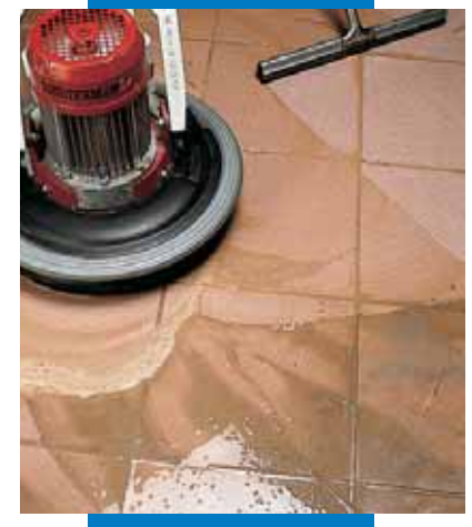
Finishing a porcelain tiled floor with single-brushed power float or rubber squeegee