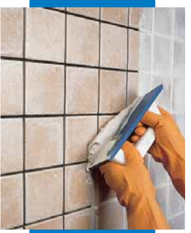
Grouting of single fired tile wall with a float