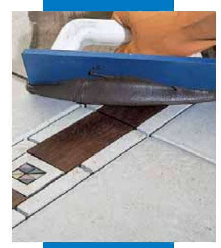
Grouting a ceramic tile floor with wood inlays with a trowel