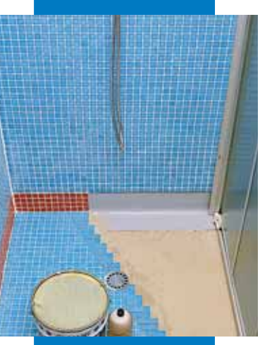
Waterproofing and laying in a prefabricated shower unit