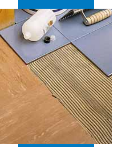
Laying on an old PVC